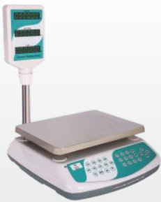
PRICE COMPUTING SCALE